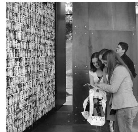
"Missing of the Somme" panel

every walk of life, the miner, the labourer, the baker, the accountant, the poet, the lawyer, the sportsman, the student, etc., they are all there on the Memorial. The thought of what they did and the impact that their loss had on the families at home are still haunting. The wives and mothers who never came to terms with the loss, waiting for their husbands or sons to return, "one day". Children placed into orphanages and sent to a new life in Australia and Canada. Streets and villages that were united in mourning as a result of the well-meaning Pals battalions. The men and boys who were working around the Empire but left their jobs to return to help the Mother Country. All represent stories that we should never forget. During the time that we worked on the project the faces of these men have become familiar to us. Through their individual stories we feel that we have developed a personal connection with them and their families. Even this familiarity could not prepare us for the impact of seeing the panel for the first time. Looking into the faces of these