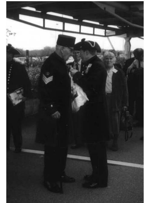
Chelsea Pensioners smartening up on arrival at Haute Picardie