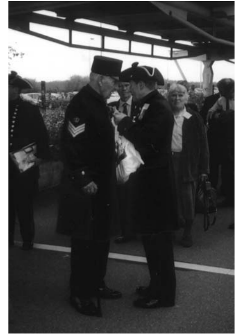
Chelsea Pensioners smartening up on arrival at Haute Picardie