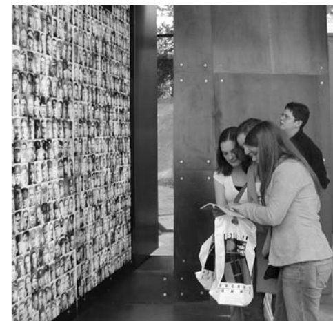
"Missing of the Somme" panel

every walk of life, the miner, the labourer, the baker, the accountant, the poet, the lawyer, the sportsman, the student, etc., they are all there on the Memorial. The thought of what they did and the impact that their loss had on the families at home are still haunting. The wives and mothers who never came to terms with the loss, waiting for their husbands or sons to return, "one day". Children placed into orphanages and sent to a new life in Australia and Canada. Streets and villages that were united in mourning as a result of the well-meaning Pals battalions. The men and boys who were working around the Empire but left their jobs to return to help the Mother Country. All represent stories that we should never forget. During the time that we worked on the project the faces of these men have become familiar to us. Through their individual stories we feel that we have developed a personal connection with them and their families. Even this familiarity could not prepare us for the impact of seeing the panel for the first time. Looking into the faces of these