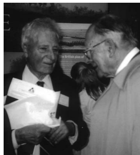
Earls Kitchener and Haig in conversation