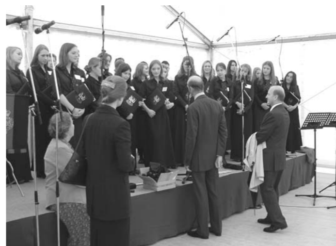
HRH The Duke of Kent meets the Choir

THETFORD GRAMMAR SCHOOL CHOIR AT THE EDUCATION CENTRE INAUGURATION